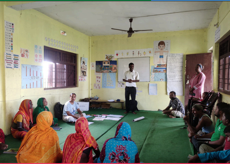
ENTREPRENEURSHIP DEVELOPMENT AND MARKET LINKAGE FOR VEGETABLE PRODUCTION, SAPTARI, AUGUST 6-8, 2024

To enhance the profitability of vegetable-producing farmers, an Entrepreneurship Development and Market Linkage for Vegetable Production training was conducted at Tilathikoiladi RMP-04. The training aimed to transform small-scale farmers into entrepreneurs by teaching them market linkage and entrepreneurship skills.