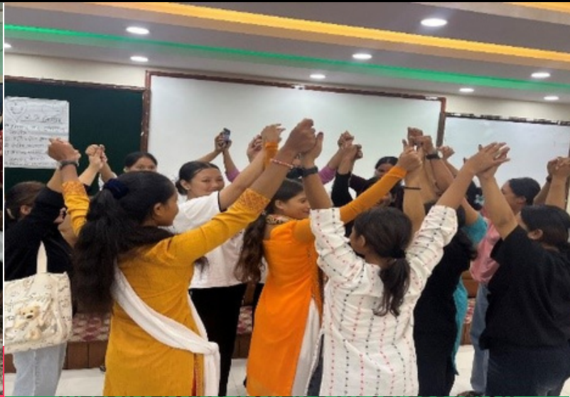
INTERNATIONAL YOUTH DAY CELEBRATION PROGRAM: SPEECH COMPETITION, DHADING, AUGUST 12, 2024

The event successfully raised awareness about the importance of digital literacy, encouraged the use of digital skills for sustainable development, and provided practical advice for navigating the digital world safely.