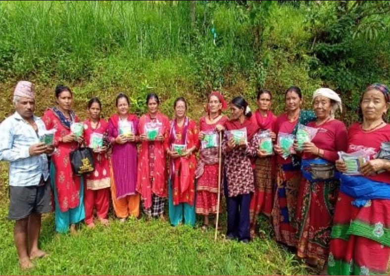
COMPOSITE (VEGETABLE) SEED DISTRIBUTION, DHADING, SEPTEMBER 30, 2024