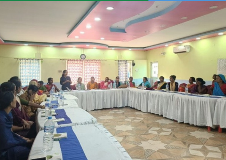
BI-ANNUAL REVIEW MEETING FOR RUPANTRAN PROJECT, RAUTAHAT, AUGUST 24-25, 2024

The bi-annual project review meeting took place for two days and was supported by staff from ROYM Nepal's central office as well as project staff from the Rupantaran project.