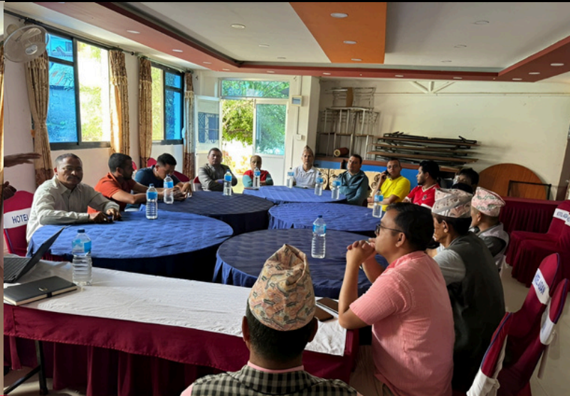
FORMATION OF YHRD IN WEST RUKUM, KARNALI, JULY 25, 2024

ROYM Nepal successfully conducted a Youth Human Rights Defenders (YHRDs) mapping workshop in West Rukum on July 22, 2024, under the EKATA project. This initiative aims to identify and engage young activists within various community groups. During the workshop, stakeholders from diverse backgrounds discussed the importance of young human rights defenders and their roles in promoting human rights at the grassroots level. The mapping process identified 20 passionate young individuals eager to make a difference in their communities. This workshop laid the foundation for forming a robust network of young human rights defenders in the district.