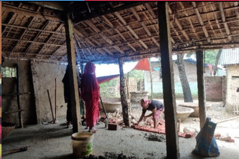
YHRD MAPPING IN SURKHET, KARNALI, AUGUST 15, 2024