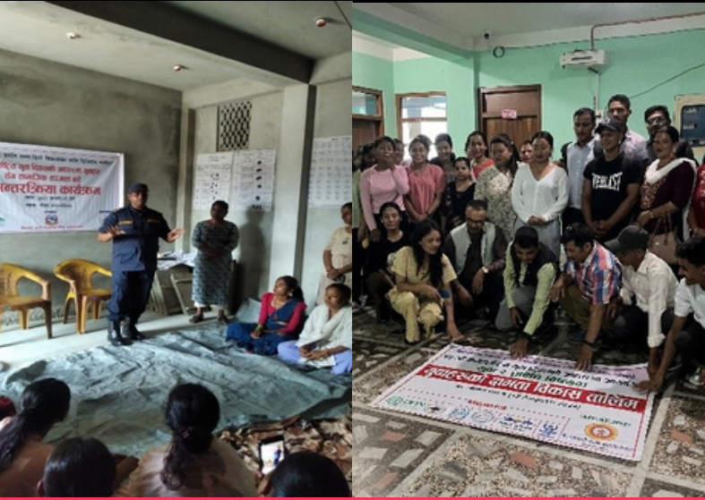
INTERNATIONAL YOUTH DAY 2024: "YOUTH DIGITAL PATHWAYS FOR SUSTAINABLE DEVELOPMENT", DHADING AND SARLAHI, AUGUST 12, 2024

ROYM Nepal organized an International Youth Day Interaction Program across multiple locations, focusing on the theme "Youth and Technology" in Dhading and Sarlahi.