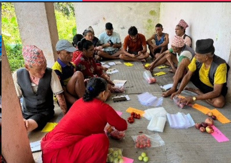
GRADING, PACKAGING, AND MARKETING MANAGEMENT TRAINING, DHADING, SEPTEMBER 24, 2024

YHRDs network was formed in Humla, following a successful mapping workshop. Twenty-eight young activists came together to establish the network, with comprehensive training on human rights principles