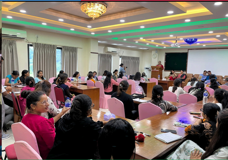
DISTRICT LEVEL YOUTH NETWORK FORMATION PROGRAM, DHADING, AUGUST 11, 2024

Participants expressed satisfaction with the training, and the initiative promised to link them with the Cottage and Small Industry Office in Rajbiraj for additional skill-based training.