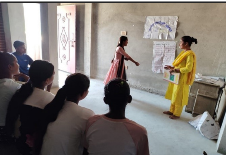
COMMUNITY ORIENTATION THROUGH PEER EDUCATORS, SARLAHI, AUGUST 5, 2024

We have provided seed money support to three rights holders to initiate livelihood activities aimed at improving socio-economic status by increasing access to resources and economic opportunities at the local level. One right holder from Rautahat received assistance to start a snack stall. Additionally, two rights holders from Mahottari received seed money support: one to set up a photocopy and printing shop and the other to purchase goats to develop a livestock business.