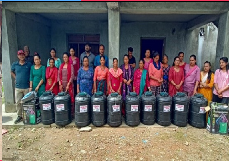
ORIENTATION FOR FARMERS GROUP ON BIO-PESTICIDE MAKING UP, DHADING, SEPTEMBER 11, 2024

The motorcycle repair training program, initiated on September 1, 2024, was a 60-day initiative aimed at improving the socio-economic conditions of underprivileged youth. Targeting 14 young male participants, the program focuses on equipping them with fundamental skills in motorcycle repair and maintenance. The trainees were selected based on their strong interest in learning skills that can help them start their businesses or secure employment in the field. Currently, they are participating in basic repair techniques, which will pave the way for more advanced training as the program progresses. By offering access to resources and professional knowledge, the program seeks to empower participants with practical skills, enabling them to seize economic opportunities at the local level, ultimately helping to improve their livelihoods and foster long-term self-reliance.