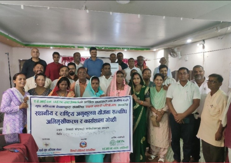
ORIENTATION WORKSHOP TO THE LOCAL GOVERNMENT ON LAPA AND NAPA FRAMEWORK, SAPTARI, AUGUST 15, 2024