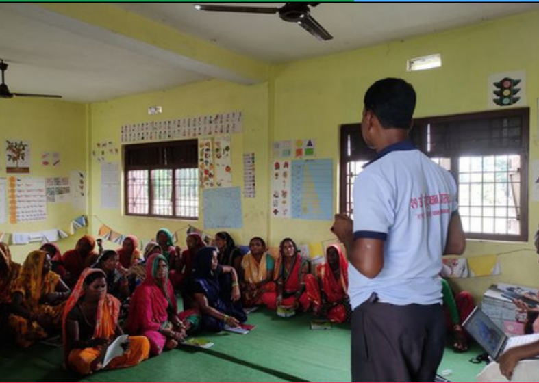
POST-TRAINING SUPPORT TO FARMERS ON CLIMATE-SMART AGRICULTURAL PRACTICES , SAPTARI, JULY 7-12, 2024

To assess the effectiveness of these activities and trainings, a follow-up training was conducted. Purpose of the training was to counsel, guide, and mentor the farmers productively, helping them adopt beneficial business models. Sessions included preparing charts of the current situation of their farms and guiding them in creating future plans. These follow-up trainings significantly helped in understanding the current farm situations and preparing plans for improvement. Additionally, they identified non-agricultural livelihood options for the participants. Despite the busy planting season for Paddy in Terai, the training saw good participation due to a heavy downpour that halted agricultural activities. The training venue was set in Shree Rajendra Devaki Higher Secondary School premises to avoid the muddy conditions prevalent in the locale during the rainy season. Two training events were conducted successively from July 7th to July 12th, 2024. The first session ran from July 7th to July 9th, and the second from July 10th to July 12th. The sessions included recaps of previous trainings, feedback sessions, and workplan preparations. Participants were divided into groups and tasked with preparing and presenting workplans for their farms and livelihood activities. Common demands included Composting Training and materials, Bamboo handicraft, Knitting, and Sewing trainings.