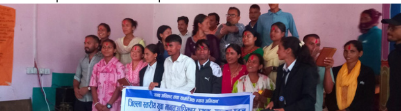
YHRD FORMATION IN HUMLA, KARNALI, SEPTEMBER 23, 2024

To empower youth and women from marginalized communities and improve their livelihoods, an off-farm skill development training program was carried out in the Sarlahi and Mahottari districts. In Sarlahi, 15 girls and young women participated in a bangle-making training program, where they learned the skills to create bangles and earn income through this craft. This initiative provides them with the opportunity to achieve financial independence by meeting local market demands. In Mahottari, 16 participants received training in the beauty and hairdressing field. Twelve participants were trained in beautician skills, learning various techniques to offer beauty services, while four participants gained knowledge in hairdressing. This practical training equips participants with the tools to start their beauty businesses or find employment in salons. Through these initiatives, the program aims to improve the socio-economic status of the participants, promoting self-reliance and personal development in the process.