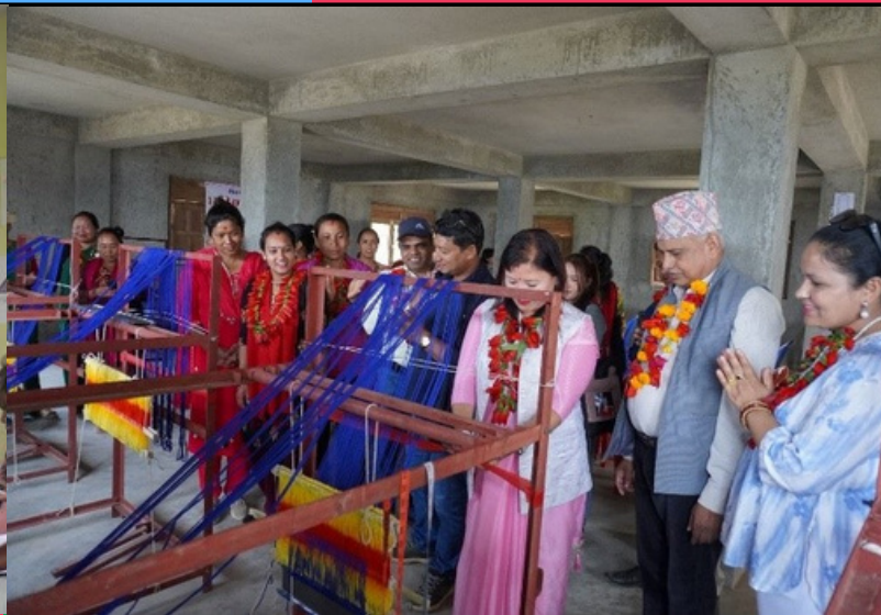
THREE-MONTH DHAKA WEAVING TRAINING CLOSING PROGRAM, DHADING, JULY 15 2024

To assess the effectiveness of these activities and trainings, a follow-up training was conducted. Purpose of the training was to counsel, guide, and mentor the farmers productively, helping them adopt beneficial business models. Sessions included preparing charts of the current situation of their farms and guiding them in creating future plans. These follow-up trainings significantly helped in understanding the current farm situations and preparing plans for improvement. Additionally, they identified non-agricultural livelihood options for the participants. Despite the busy planting season for Paddy in Terai, the training saw good participation due to a heavy downpour that halted agricultural activities. The training venue was set in Shree Rajendra Devaki Higher Secondary School premises to avoid the muddy conditions prevalent in the locale during the rainy season. Two training events were conducted successively from July 7th to July 12th, 2024. The first session ran from July 7th to July 9th, and the second from July 10th to July 12th. The sessions included recaps of previous trainings, feedback sessions, and workplan preparations. Participants were divided into groups and tasked with preparing and presenting workplans for their farms and livelihood activities. Common demands included Composting Training and materials, Bamboo handicraft, Knitting, and Sewing trainings.