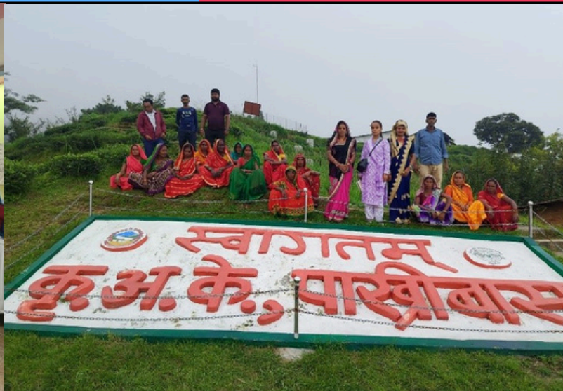
EXPOSURE VISIT OF THE FARMERS , SAPTARI, AUGUST 27-29, 2024

Additionally, the finance department addressed various staff queries regarding bills, advance requests, and settlement processes, ensuring smooth financial operations moving forward.