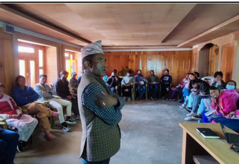
YHRD MAPPING IN JAJARKOT, KARNALI, JULY 28, 2024

On July 25, 2024, ROYM Nepal facilitated the formation of the Youth Human Rights Defenders (YHRDs) network in West Rukum. Following the successful mapping workshop, 31 young human rights defenders were selected to form the network. The event included comprehensive orientation sessions on human rights and the critical role of youth in their protection and promotion. Participants engaged in vibrant discussions with local authorities, including the Chief District Officer and police officials, addressing challenges and strategizing on effective human rights advocacy. The formation of this network marks a significant step in empowering youth to champion human rights in West Rukum.