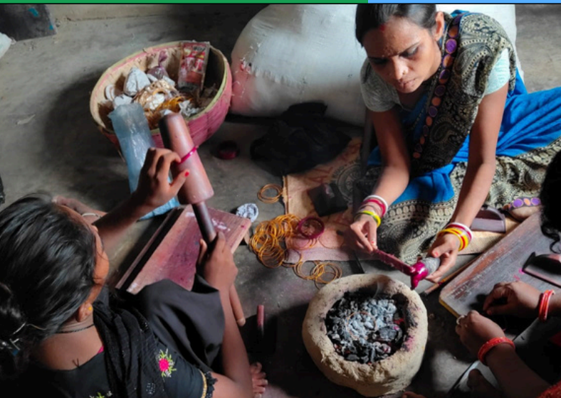
OFF FARMING TRAINING, SARLAHI AND MAHOTTARI, SEPTEMBER 12, 2024

To empower youth and women from marginalized communities and improve their livelihoods, an off-farm skill development training program was carried out in the Sarlahi and Mahottari districts. In Sarlahi, 15 girls and young women participated in a bangle-making training program, where they learned the skills to create bangles and earn income through this craft. This initiative provides them with the opportunity to achieve financial independence by meeting local market demands. In Mahottari, 16 participants received training in the beauty and hairdressing field. Twelve participants were trained in beautician skills, learning various techniques to offer beauty services, while four participants gained knowledge in hairdressing. This practical training equips participants with the tools to start their beauty businesses or find employment in salons. Through these initiatives, the program aims to improve the socio-economic status of the participants, promoting self-reliance and personal development in the process.