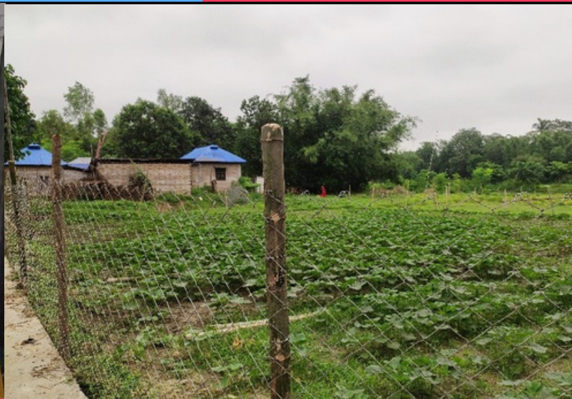
FENCING OF THE SITE FOR COMMUNITY-BASED MULTI-PURPOSE NURSERY AND OTHER CONSTRUCTION WORKS, SAPTARI, JULY 5, 2024

To ensure the effectiveness of the program, pre-tests and post-tests were conducted, demonstrating significant improvements in the participants; understanding and awareness of the covered topics.