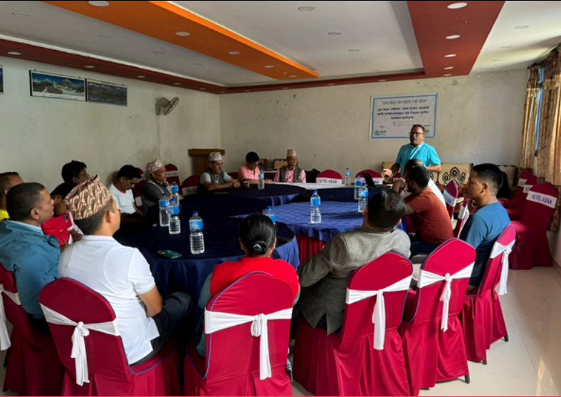
YHRD MAPPING IN WEST RUKUM, KARNALI, JULY 22, 2024

ROYM Nepal successfully conducted a Youth Human Rights Defenders (YHRDs) mapping workshop in West Rukum on July 22, 2024, under the EKATA project. This initiative aims to identify and engage young activists within various community groups. During the workshop, stakeholders from diverse backgrounds discussed the importance of young human rights defenders and their roles in promoting human rights at the grassroots level. The mapping process identified 20 passionate young individuals eager to make a difference in their communities. This workshop laid the foundation for forming a robust network of young human rights defenders in the district.