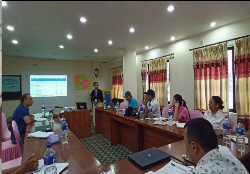
SEMI-ANNUAL REVIEW AND PLANNING MEETING OF ROYM NEPAL , DHADING, AUGUST 15 2024,

We conducted an orientation workshop on the Local Adaptation Plan of Action (LAPA) and National Adaptation Plan of Action (NAPA) frameworks for local government officials' in Tilathikoiladi RMP ward 04. Local governments, formed after federalism in Nepal, develop plans for various sectors like education, health, infrastructure, and agriculture. However, these plans often lacked grassroots-level implementation and environmental impact assessments, resulting in issues such as floods and pollution. To address this, the workshop aimed to orient local representatives and staff on LAPA and NAPA frameworks, data collection processes, and climate adaptation strategies. Formal invitations were sent to key officials, and the workshop was held at Rajbiraj. Participants included the Chairperson, Vice-chairperson, Chief Administrative Officer, executive members, ward chairpersons, and section chiefs. The workshop, covered adaptation, mitigation, LAPA, vulnerability, disaster, risk, and related terminologies. Participants also filled out vulnerability index forms to understand and plan for local climate challenges. The event was well-received, with 39 participants (6 female and 31 male) gaining valuable insights and committing to integrating LAPA and NAPA frameworks into their planning processes. This workshop marked a significant achievement for the ROYM Nepal as we are the first NGO to introduce and endorse LAPA and CAP in coordination with the municipality.