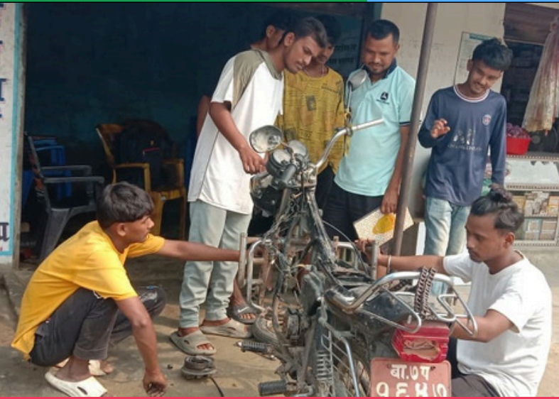
MOTORCYCLE REPAIRING TRAINING, GUJARA MUNICIPALITY, RAUTAHAT, SEPTEMBER 1, 2024