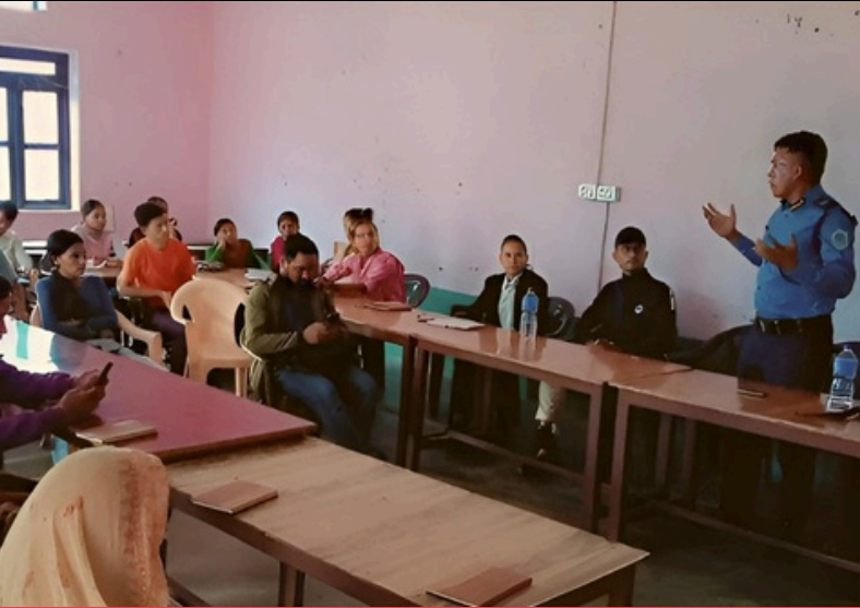
FORMATION OF YHRD IN JAJARKOT, KARNALI, JULY 30, 2024

Following the successful mapping in Jajarkot, the formation of the Youth Human Rights Defenders (YHRDs) network took place on July 30, 2024. Thirty dedicated young activists came together to establish the network, receiving thorough training on human rights principles and youth engagement. The formation event also included interactive sessions with district authorities, enhancing understanding of human rights issues and collaborative approaches to address them. This newly formed network is poised to drive impactful human rights initiatives in Jajarkot.