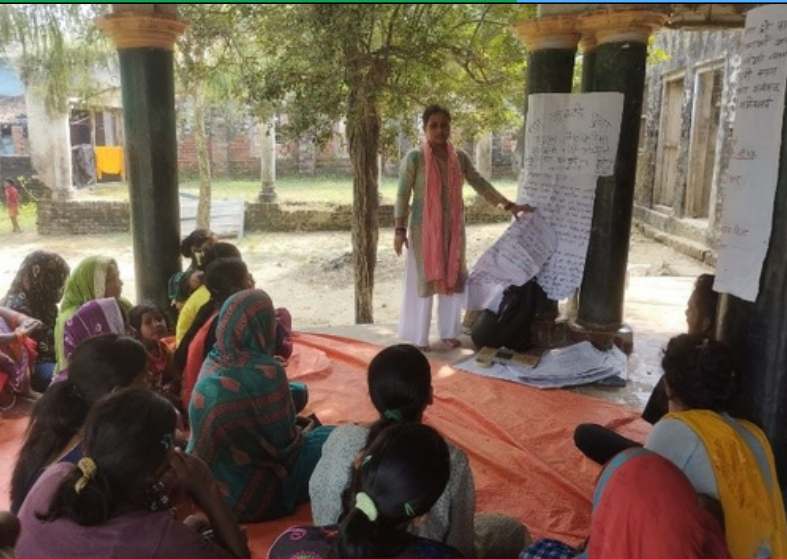
ORIENTATION TO FRAMERS GROUPS AND COMMUNITY ON SOCIAL TRANSFORMATION, HARMFUL TRADITIONAL PRACTICES, AND SOCIO-JUSTICE, RAUTAHAT, JULY 5, 2024

We recently conducted orientation sessions and meetings for various community groups, including women's groups, women farmers and youth groups. These sessions focused on a range of essential topics aimed at fostering social transformation, addressing harmful traditional practices, and promoting socio-justice.