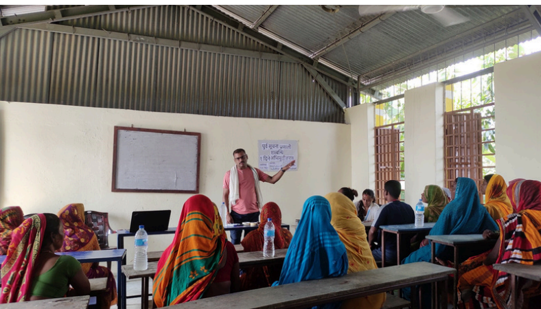
COMMUNITY ORIENTATION ON EARLY WARNING SYSTEM, SAPTARI, AUGUST 22, 2024

In recent years, climate change has affected livestock raising and animal health sectors, with new parasites and diseases thriving due to rising temperatures. To adapt, we initiated the construction of Improved Animal Sheds (IASs). These sheds provide various benefits, including better sanitation, enhanced living conditions for animals, and control of methane emissions. The project supported eight farmers in improving their sheds, hoping to inspire more farmers to follow suit. Farmers were selected based on guidelines and consultations with ward offices. Initially hesitant, they agreed to a partnership program covering half of the construction budget after counseling. The construction was closely monitored to ensure quality and desired design. Feedback from farmers was positive, with increased demand for improved sheds. The program also educated farmers on the benefits of using cattle urine in composting and bio-pesticide preparation. The constructed sheds now offer a sanitary environment for animals, making it easier to collect cattle dung and urine, supporting good composting techniques and reducing the use of harmful chemical fertilizers.