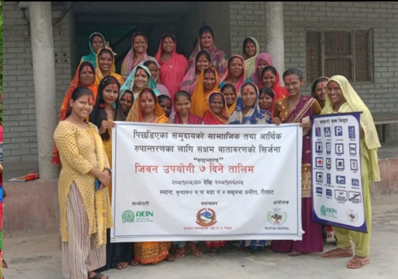
LIFE SKILLS TRAINING PROGRAM IN BRINDAWAN-7, RAUTAHAT AND SARLAHI, SEPTEMBER 24, 2024

On 29th and 30th September 2024, ROYM Nepal Dhading branch, through the JIBIKA project, organized a composite vegetable seed distribution event in Neelkantha Municipality Ward No. 5 and Netrawoti Dabjong RM Ward No. 5.