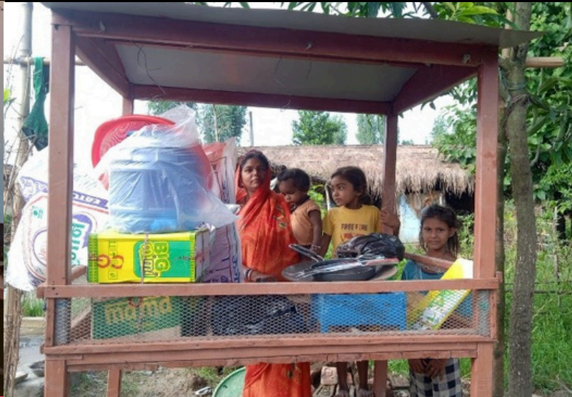
SEED MONEY SUPPORT, RAUTAHAT AND MAHOTTARI, AUGUST 2, 2024

Following the successful mapping in Jajarkot, the formation of the Youth Human Rights Defenders (YHRDs) network took place on July 30, 2024. Thirty dedicated young activists came together to establish the network, receiving thorough training on human rights principles and youth engagement. The formation event also included interactive sessions with district authorities, enhancing understanding of human rights issues and collaborative approaches to address them. This newly formed network is poised to drive impactful human rights initiatives in Jajarkot.